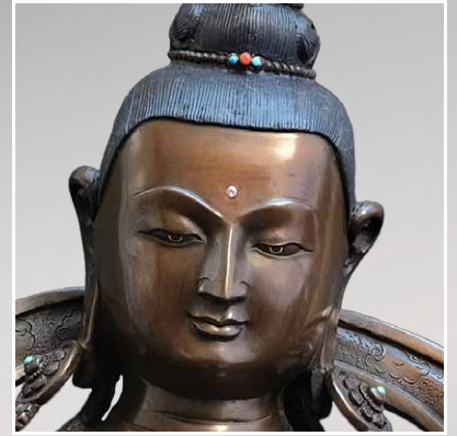
Copper statue Single-tone oxidized finish Height: 52 cm Width: 39 cm Depth: 30 cm Weight: 12.5 kg

Vajrasattva (Dorje Sempa) is regarded as the Bodhisattva of Purity and is venerated within the Vajra family. He is revered for helping practitioners dissolve unwholesome karma and attain inner purity. The combination of ethical conduct and Vajrasattva meditation is designed to facilitate precisely this purification and inner clarity.